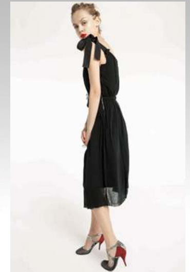
Input : Ribbons and knot